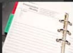
• 2 - Day Conference