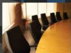
• Ministerial Meeting