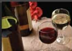
• Networking Cocktail Party