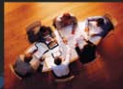
• Investors and Project Developers One on One Meeting