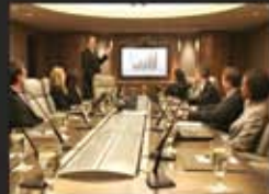
• Renewable Energy & Clean Technology Interactive Roundtables