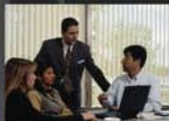
• Project Showcase and Presentation